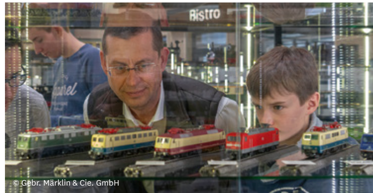
© Gebr. Märklin & Cie. GmbH